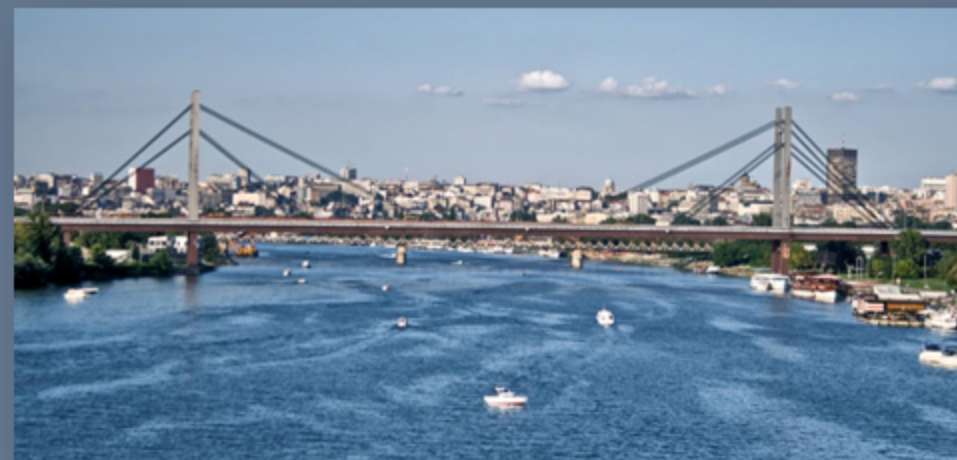
Railway Bridge over Sava River, Belgrade