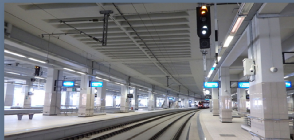
Railway Station "Belgrade Center", Belgrade